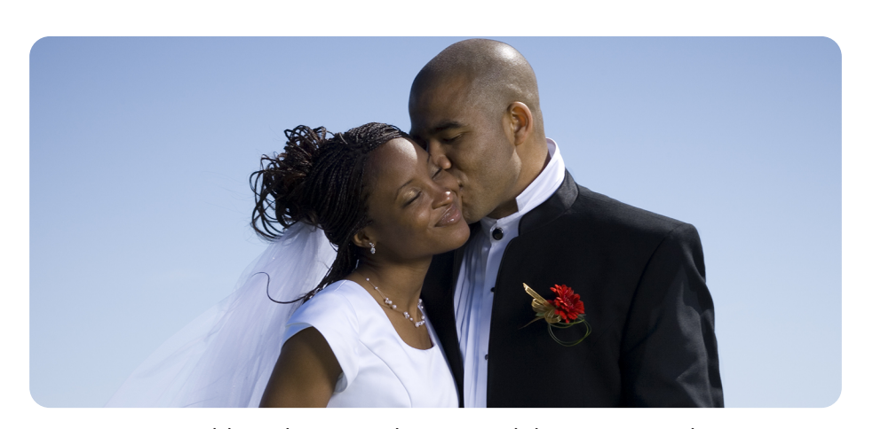
Weddings happen when two adults get married.