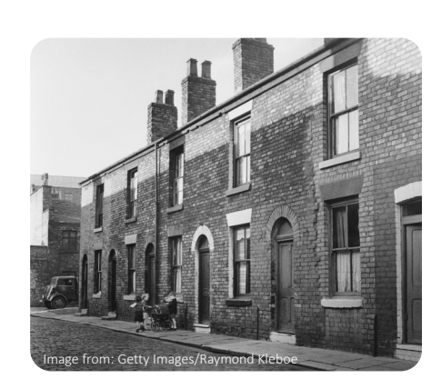
A street in the 1950s.

The way people use land changes over time. For example, in the 1950s there were fewer cars, so fewer roads were needed. Today lots of people have cars, so there are many more roads for people to drive on and driveways for parking.