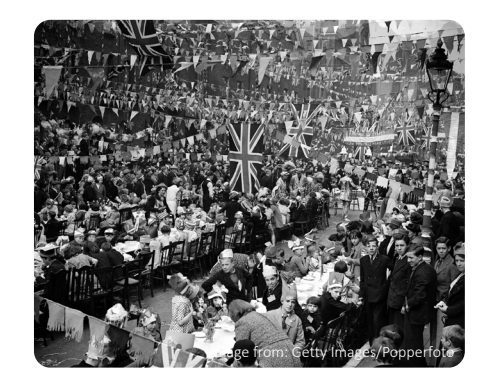
Street party to celebrate the coronation.