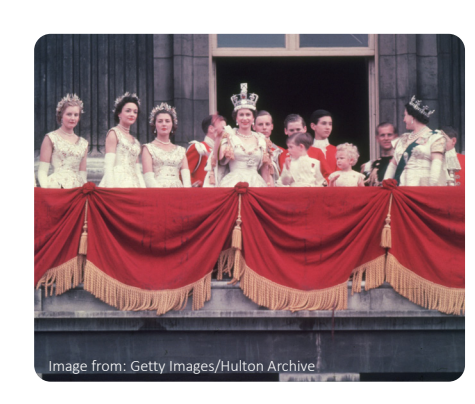
Queen Elizabeth II on her coronation.

A coronation is a ceremony where the crown is placed on the head of the new king or queen. Elizabeth II is the Queen of the United Kingdom. The coronation of Elizabeth II took place on 2nd June 1953 at Westminster Abbey, London. Many people celebrated the coronation by holding street parties.