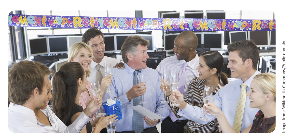
Retirement happens when an elderly person leaves work.