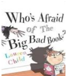
Who's Afraid of the Big Bad Book by Lauren Child

Through our English lessons, we will look to continue writing skills such as writing sentences using full stops, capital letters and question marks correctly. We will also encourage the children to use the joins they have been learning in handwriting in all of their written work in class.