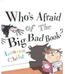
Who's Afraid of the Big Bad Book by Lauren Child

Through our English lessons, we will look to continue writing skills such as writing sentences using full stops, capital letters and question marks correctly. We will also encourage the children to use the joins they have been learning in handwriting in all of their written work in class.